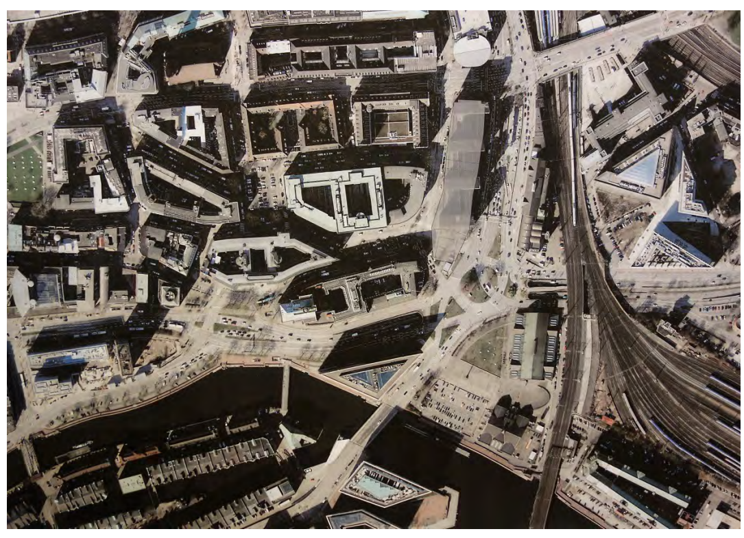
Fig. 1. World Heritage property (area of the Kontorhaus district) and the City-Hof in the buffer zone.

One of the mission experts was already familiar with the area and the second extended her stay to allow for a fuller appreciation of the City-Hof and its surroundings.