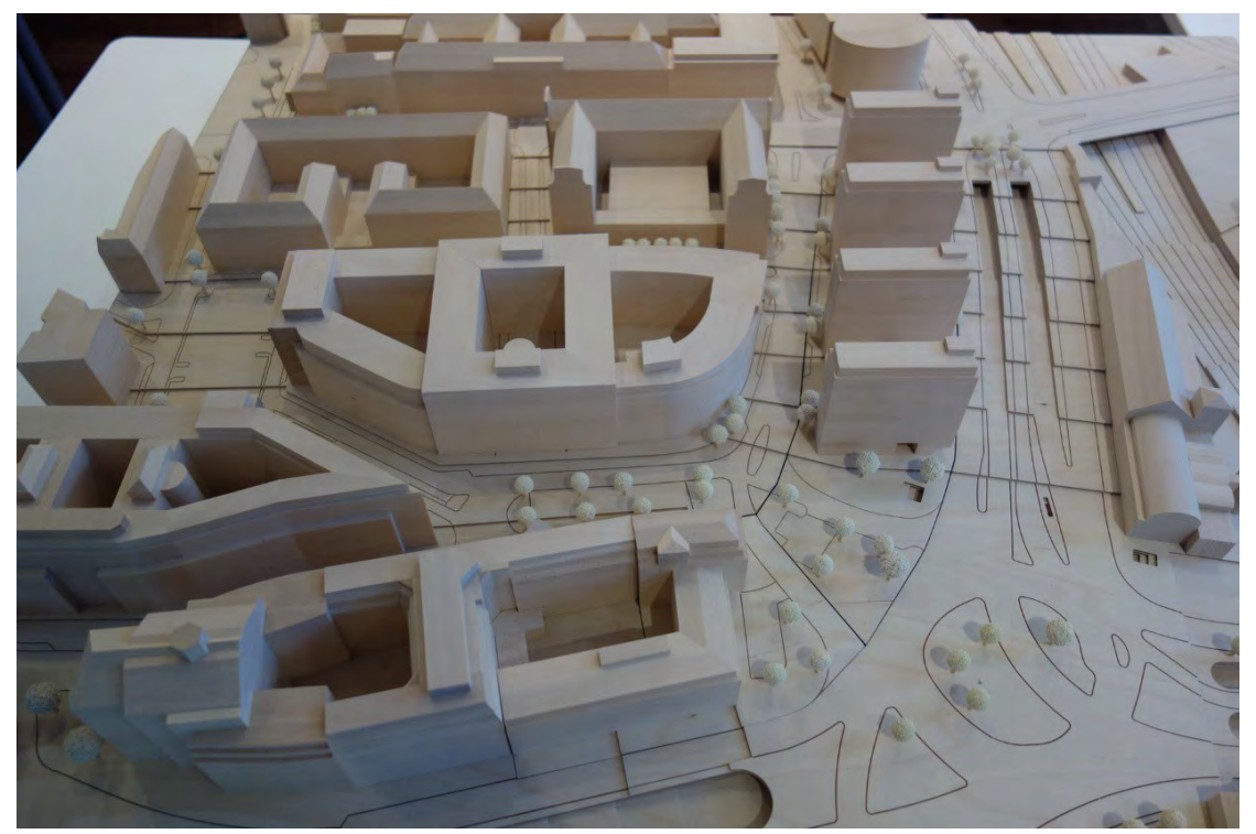
Fig.6. Model of the Kontorhaus district and the City-Hof. Present situation.

providing a hotel, offices, housing and new squares which would upgrade public spaces and be a positive contribution to this edge of the city.