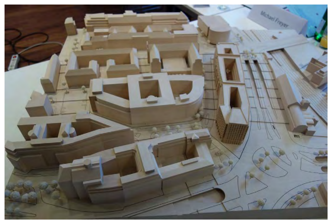
Fig. 7. Model of the Kontorhaus district and a new project at Klosterwall.