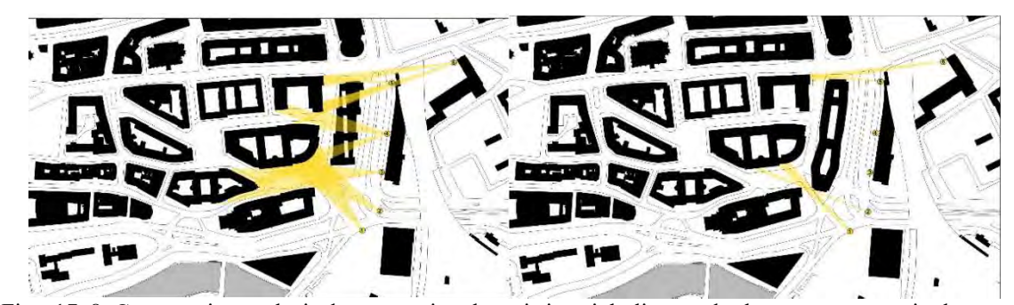
Figs. 17, 8. Comparative analysis demonstrating the existing sight lines and urban transparency in the area of the City-Hof and their blockade by a new projected massive building.

At the time of inscription, the ICOMOS evaluation found that the legal protection and management of the property and its buffer zone were adequate, although recommendations were made on the need to encompass visitor management and to address risk preparedness. The evaluation report also commented on the lack of any mention of the involvement of local communities in the nomination dossier, although it had been stated that the future World Heritage Coordinator would liaise with representatives of various local and regional interest groups as well as the general public.