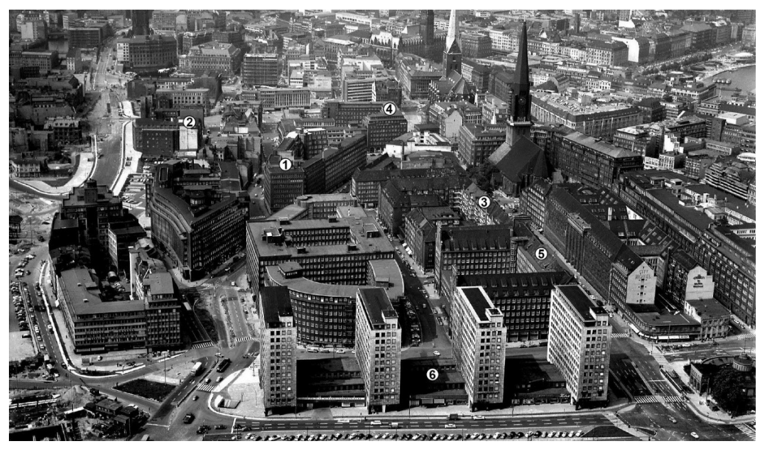
Fig. 3. Aerial view of the Kontorhaus district with the recently built City-Hof, 1958, in the foreground. Photo, the 1960s.

The context for the mission was first the consultation processes that had been undertaken in recent years by the City of Hamburg, which included competitions (the first of which supported re-use and the second demolition and re-building), and secondly the considerable and sustained opposition to the proposed demolition and re-building plans expressed by a range of organisations and individuals, including some members of the State Parliament. ICOMOS has also expressed its concerns at the proposed demolition of the City-Hof in two Technical Reviews, dated October 2016 and April 2018, that were submitted to the State Party.