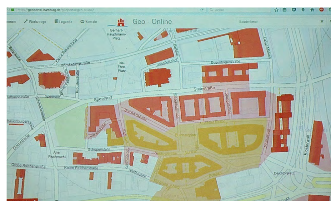
Fig. 14. Kontorhaus district. Local Protection zone (rose) and territory of the World Heritage property (yellow). The City-Hof is beyond both Protection areas, however included in the buffer zone.

Thus most of the buffer zone is in the Protection zone (but it excludes the City-Hof). The eastern boundary of the Protection zone runs along the western façade of the City-Hof. The eastern limit of the buffer zone coincides with the eastern façade of the City-Hof. At the same time, the northern area at Steinstraße, which is within the Protection zone, is not included in the buffer zone. (The following details were added by Bernd Paulowitz) The buffer zone is formed by a large area comprising (non-exhaustive list follows) around the Kontorhaus District buildings along the Kleine Reichenstraße and Schopenstehl, as well as the former IBM and Spiegel High-Rise buildings along the Willy-Brandt-Straße together with many other buildings there, the City-Hof and right next to it as well the buildings of the Bauer printing company, the more recent triangular shaped Deichtor-Centre from 2002 as well as the important Cultural Complex of the Deichtorhallen.