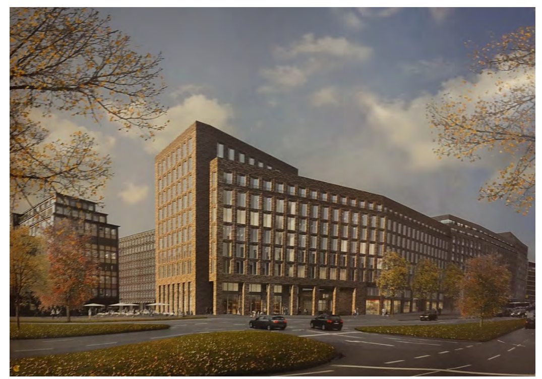
Fig. 16. Proposed replacement of the City-Hof by a new structure 'Quartier am Klosterwall', buffer zone. KPW Papay Warncke und Partner Architekten, 2017. View from the east. The most important historical view No.13 on the main façade of the Chilehaus will be closed.