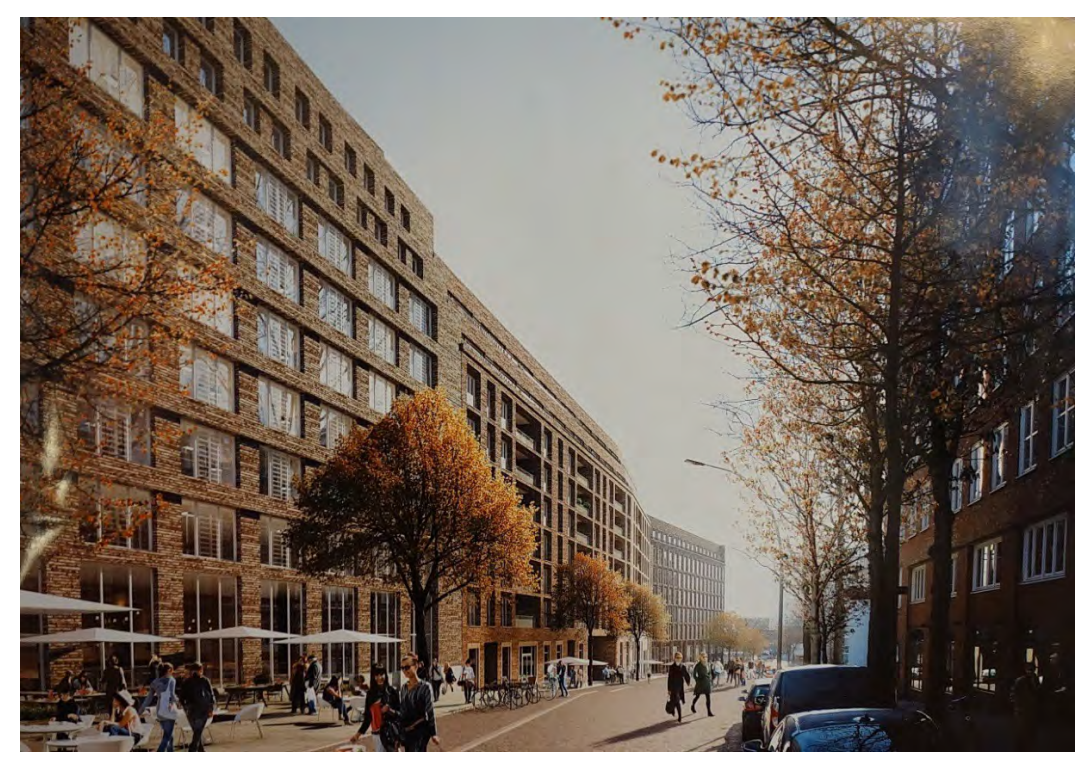
Fig. 15. Proposed replacement of the City-Hof by a new structure 'Quartier am Klosterwall', buffer zone. KPW Papay Warncke und Partner Architekten, 2017. View along Johanneswall. Credit: KPW

As the proposed replacement is of greater length than the City-Hof, and completely visually impermeable, its monolithic form and size would dominate the eastern end of the Kontorhaus. Its long linear form, which would extend further south than the current footprint of the City-Hof ensemble, would also cut off visual and other links with the urban landscape towards the station and in adjacent areas. Specifically, the most important historical view No.13 on the main façade of the Chilehaus from Deichtorplatz and its axial prolongation to the east will be blocked and replaced by a narrow 'close-up view'.