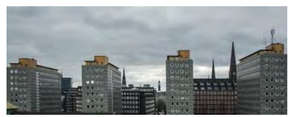
Fig. 2. Views of the Kontorhaus District between the City-Hof towers; image from Drosmann N. (Hg.), Der City-Hof. An-und Einblicke. , Hamburg 2018. Credit: Nicole Keller und Oliver Schumacher

enlargement plans between the station and the inner city. Its design of four tower blocks linked only at the lower level by service structures has a high degree of visual permeability, creating visual links between the Kontorhaus District and the area towards the station.